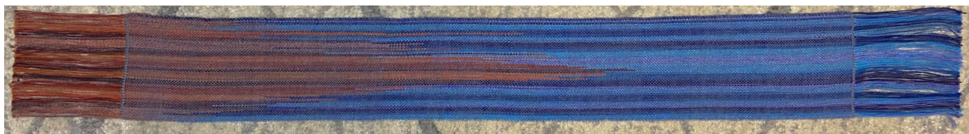
FIGURE 3: THE FINISHED SCARF